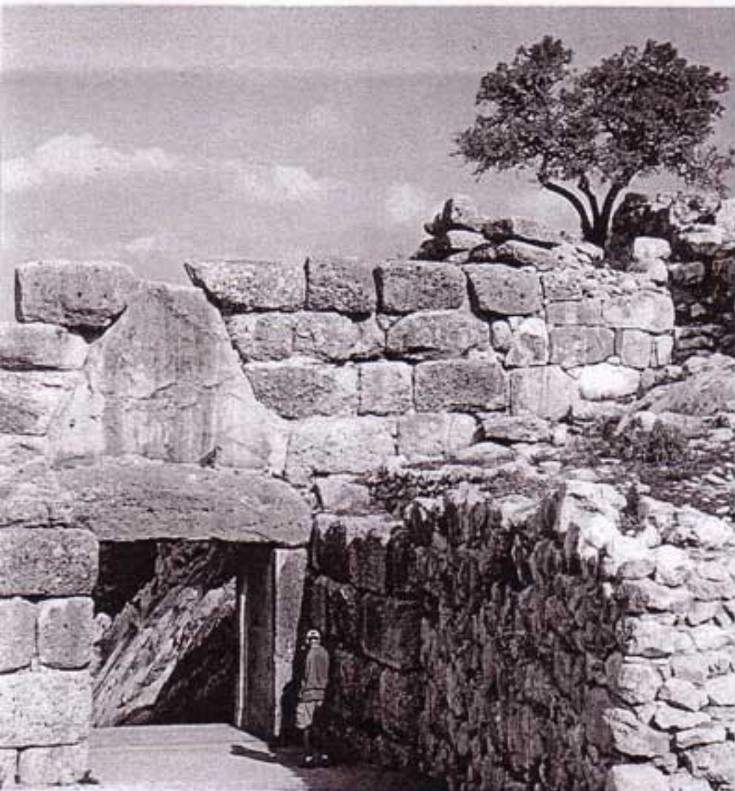
The Citadel of Mycenae. The Lions Gate, seen from behind, embedded in the Cyclopien Walls.

We saw in twilight the Canal of Corinth. It was inaugurated in 1893 - we were allowed to see it, Caesar, Caligula and Nero could only dream of it.