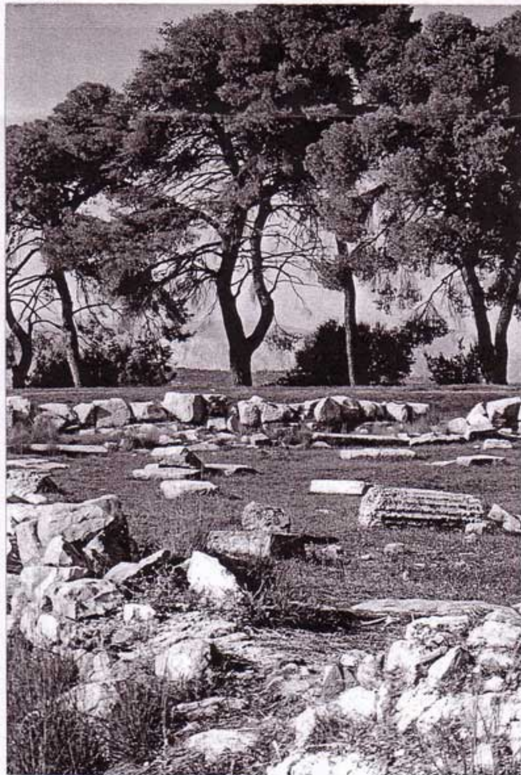
Glory and Ruins - Epidaurus.